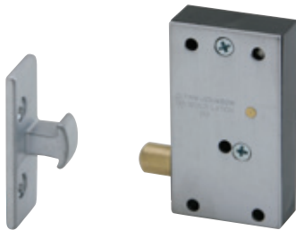
Meets ANSI/BHMA A156.9, B03272