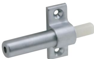
Meets ANSI/BHMA A156.9, B13282